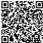
2023 AUXILIARY UNIT REMINDERS

Officer Report Forms: Completed forms must be submitted to National HQ no later than 10 days following Unit installation of officers. Please ensure names & addresses are properly spelled and phone numbers & email addresses are current.