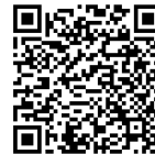
NATIONAL CONVENTION AGENDA

Are you a veteran in need of transportation to your VA medical appointments?